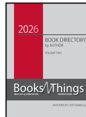
Item #286704 Book by Author Vol 2 Authors by Last Name L-Z $35.00