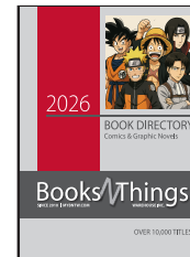
Item #344038 Book Directory Comics & Graphics Novels (Over 10,000 Titles) $20.00