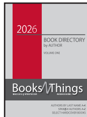
Item #286703 Book by Author Vol 1 Authors by Last Name A-K, Spanish Books, Select Hardcover $35.00