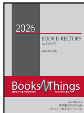
Item #286701 Book by Genre Vol 1 (Genres A-L, Spanish Books, Select Hardcover Books) $35.00