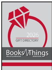
Item #286700 Gift Directory (Gifts for all ages) $20.00

List as Item # Above (Book S/H Rates Apply) - All four book directories are approximately 1,100 pages & include Calendars & Magazines